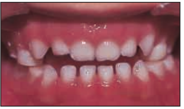
Fig. 6 PDTs bonded directly to deciduous molars.

light-cured composite in the areas of the tracks. No composite should be loaded in the incisor region, as these teeth are the reference points for setting the transfer trays. The composite resin is cured for at least 40 seconds on each molar surface. We have found it more comfortable to build the lower PDTs first, but the tracks should be placed in both arches at the same appointment.