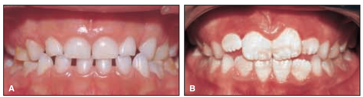
Fig. 8 A. Stability of correction after eruption of first permanent molar. B. Stability after eruption of permanent incisors, with tracks still covering occlusal surfaces of deciduous molars.

Planas Direct Tracks work by repositioning the mandible, thus preventing the establishment of morphological and positional asymmetries in young children and allowing a more symmetrical craniofacial development.<sup>1,16-30</sup> PDTs can be used to correct either posterior or anterior crossbite in the deciduous dentition, regardless of the severity of the malocclusion.<sup>31</sup> Nevertheless, a higher rate of success can be expected in young patients in whom a skeletal discrepancy has not yet been established. Even if a second phase of treatment becomes necessary, it will probably be simpler and shorter if permanent asymmetries have been prevented during prepubertal growth.